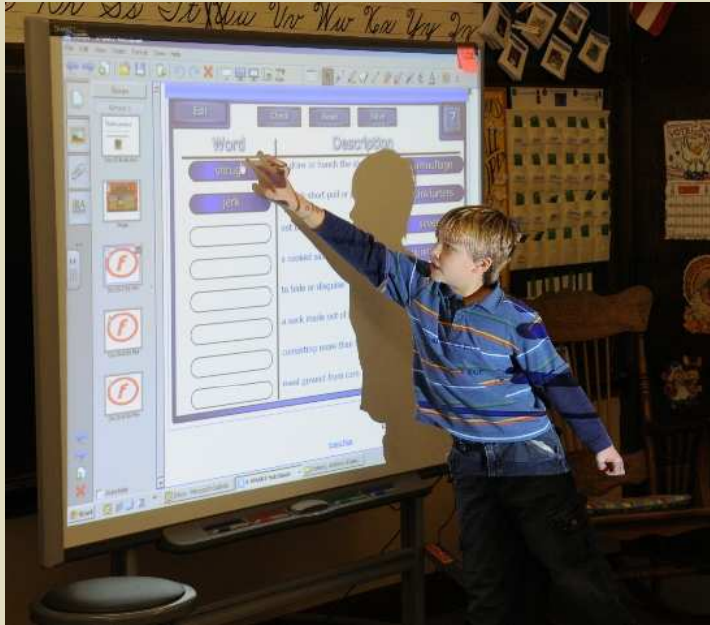
Trombly's Smart Board