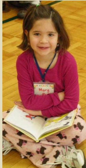
Kerby's Read In