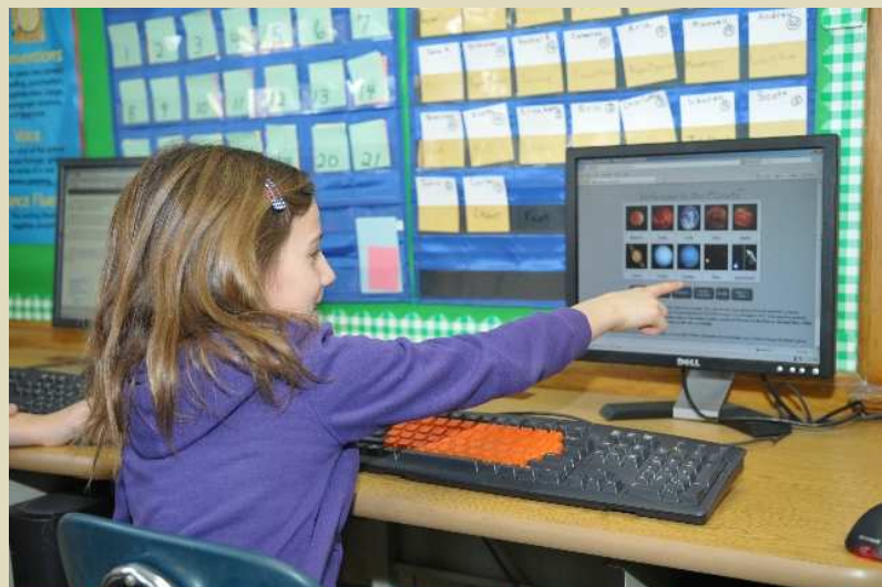
Monteith's Fast Math

Reading, writing, mathematics, science and social studies – often using technology tools to engage learners