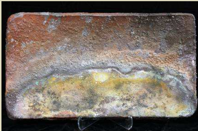
Scholastic Art Award for Pottery