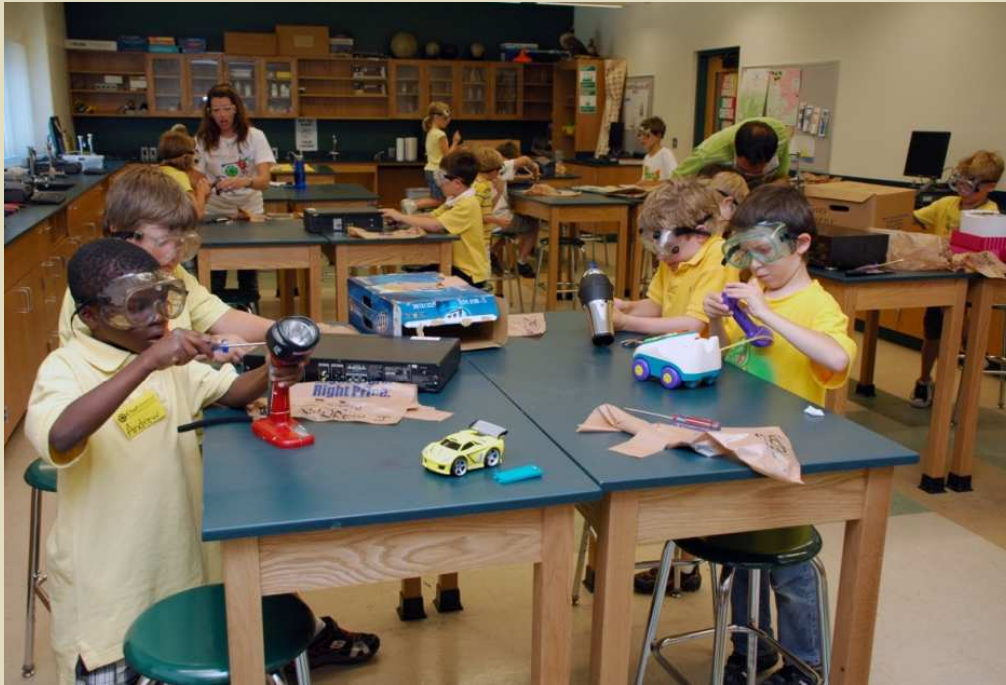
Camp Invention